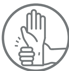
Instability in the hands, hip or knee joints